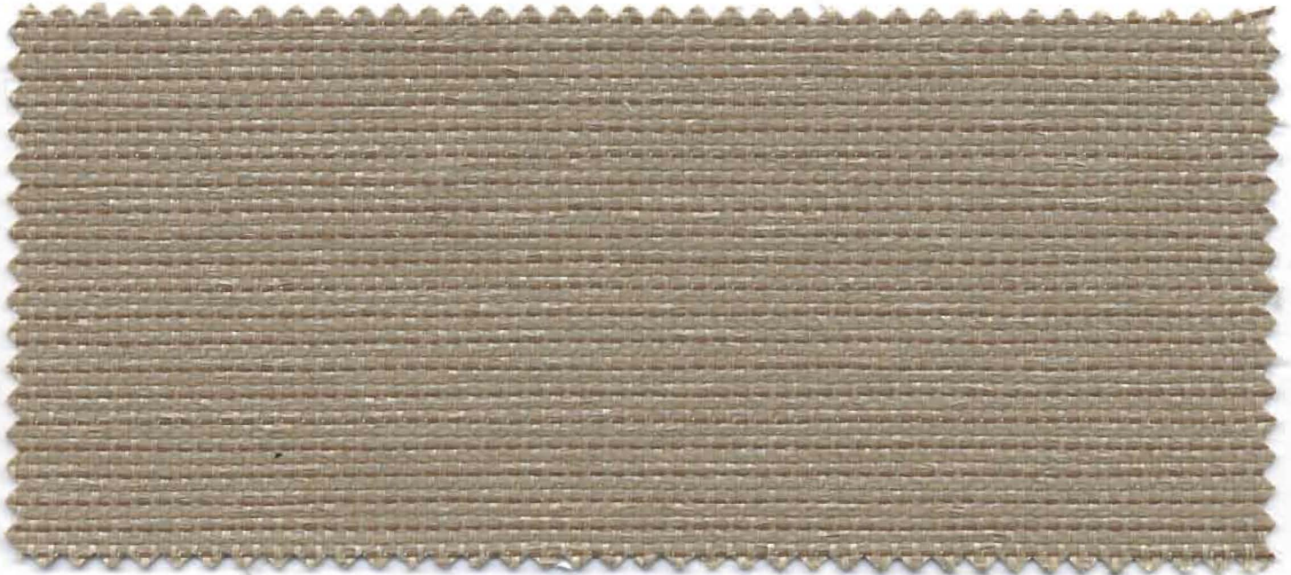
106-10 Coffee Bean

High Performance Woven Fabric for Panel and Partition Systems